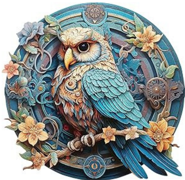
(344 wooden pieces in a wood gift box)

Our lovely winner from last month was delighted with her prize. If you want to be in with a chance to pick up our December prize of this beautiful Blumuze creative owl wooden jigsaw puzzle worth £25, then please enter below.